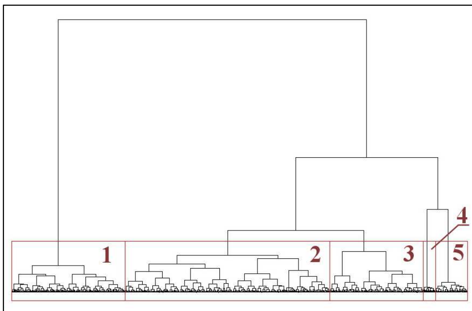
Figure 2 – Created dendrogram with 5 clusters

For the cluster analysis we have used software R version 2.12.1 and function library Rattle version 2.6.8. As the method for hierarchical cluster analysis we use euclidean metric and ward agglomerative method. For cluster analysis we use all variables from data set beside churn rate. The result dendrogram is on Figure 2. For the next steps we used the level with 5 clusters. On Figure 2 are cluster numbered ascending according to customer leaving rate (variable churn).