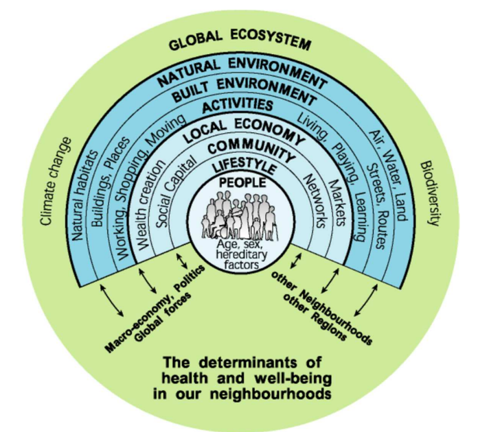
Figure 2 – The health map (Source: Barton and Grant (2006, p.2))

From a spatial perspective, Barton and Grant (2006) have mapped out the general architecture of the social and health characteristics of actors at the local level, in particular, the urban ecological and land use components (see Fig. 2). This health map offers a description of a variety of background factors and human health determinants. Its constituents will be used here as a framework to trace the impact of space on human health and wellbeing patterns.